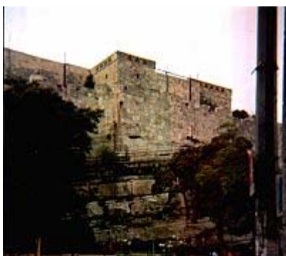
Sandstone Wall Construction