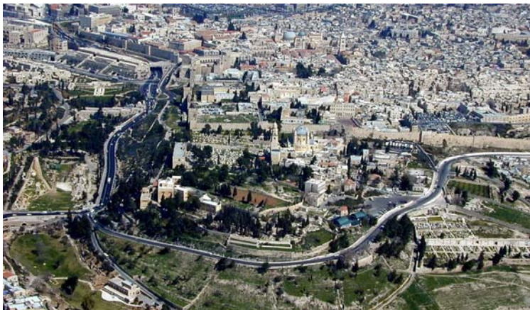
Modern Mt. Zion from the South